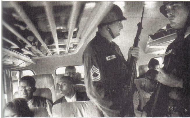
Bernard LaFayette, Jr., Freedom Rides, 1961