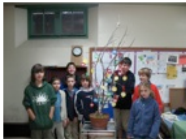
The "B" Tree