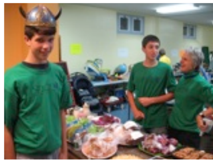
The Yard Sale

matters now is where you think you are going. After all, there is a whole itinerary to plan: Will you be traveling alone or will you welcome others on your journey? Do