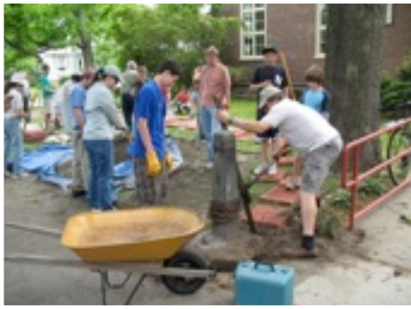
Making the path