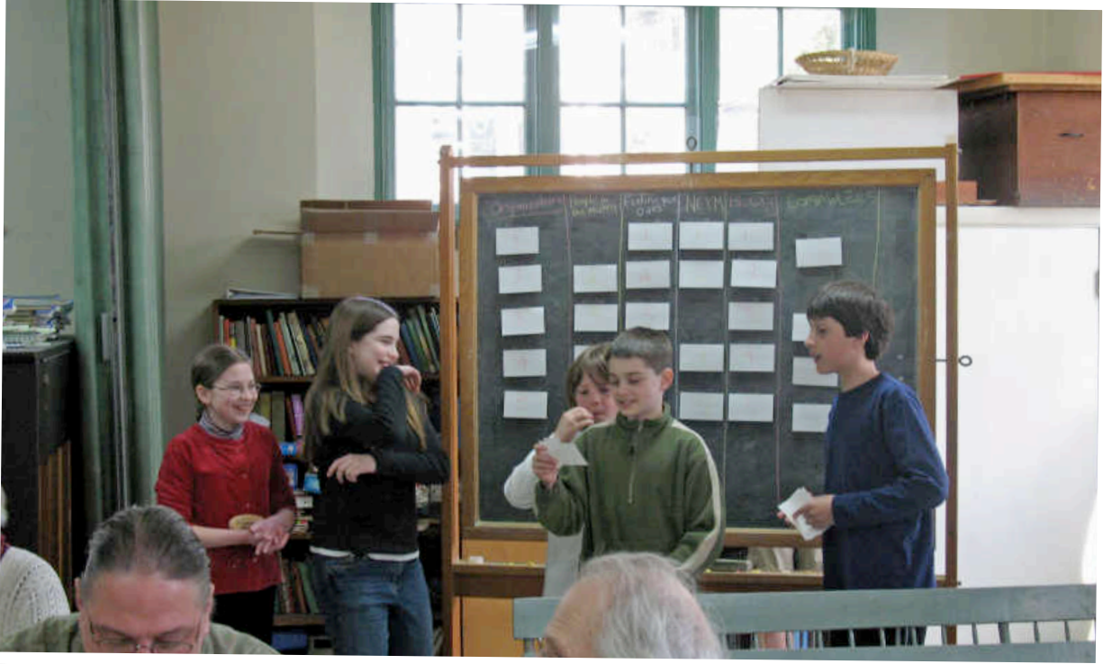
April Fools Potluck & Quaker Jeopardy