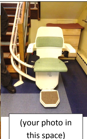
(your photo in this space)